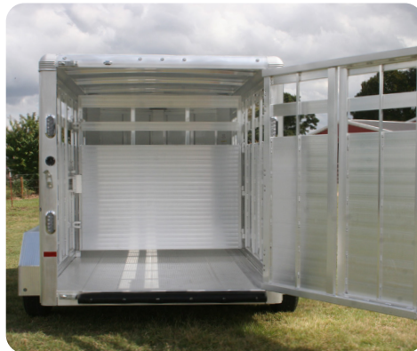
Swinging center gate standard on 16'. (Optional on 12' and 14'.)