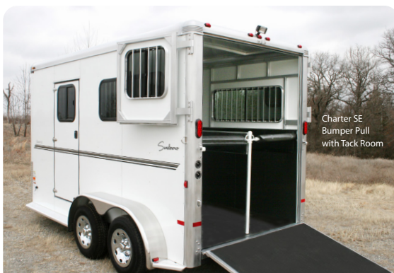
Charter SE Bumper Pull with Tack Room