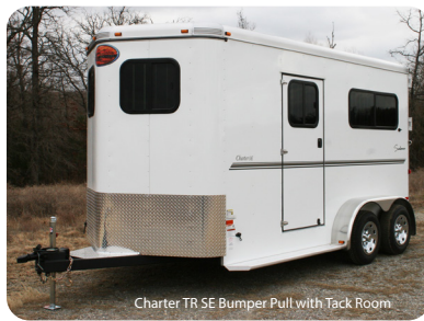
Charter TR SE Bumper Pull with Tack Room